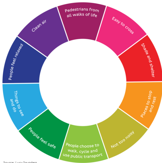
Figure 10.1 - The Ten Healthy Streets Indicators

10.2.8 The Mayor has a long-term vision to reduce road danger on the streets so that no deaths or serious injuries occur on London's streets. This Vision Zero will be achieved by designing and managing a street system that accommodates human error and ensures impact levels are not sufficient to cause fatal or serious injury. This will require reducing the dominance of motor vehicles and targeting danger at source.